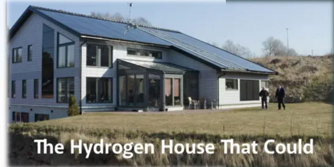
The Hydrogen House That Could